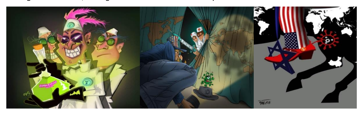
Examples from the Iranian Cartoons Exhibition on coronavirus that attribute its spread to Israel and the United States as a means to take over the world.

Culture: In March, a special coronavirus art exhibition was held in Tehran, supported by the government – the Ministry of Culture and the Office of the Vice President for Information and Technology. This exhibition is similar to previous Iranian-sponsored events promoting Holocaust denial. Most of the illustrations, also published on a dedicated website for the exhibition, promote the regime's narrative, among them several which are clearly antisemitic: